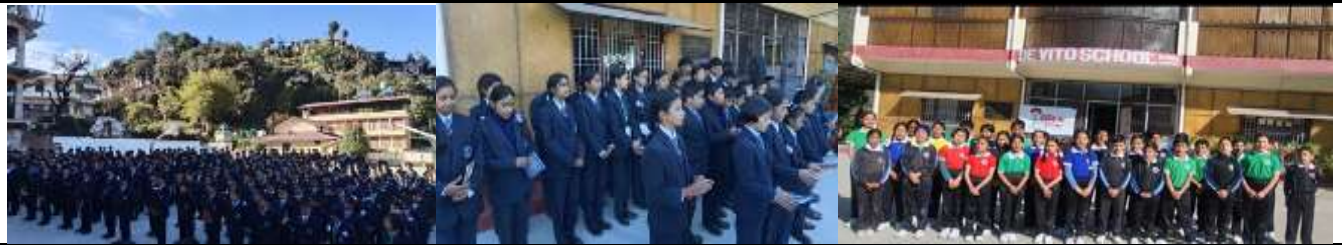
BASKETBALL MATCH AWARDEE 2025 DE VITO SCHOOL BHOWALI VS ST. PAUL'S NAINITAL