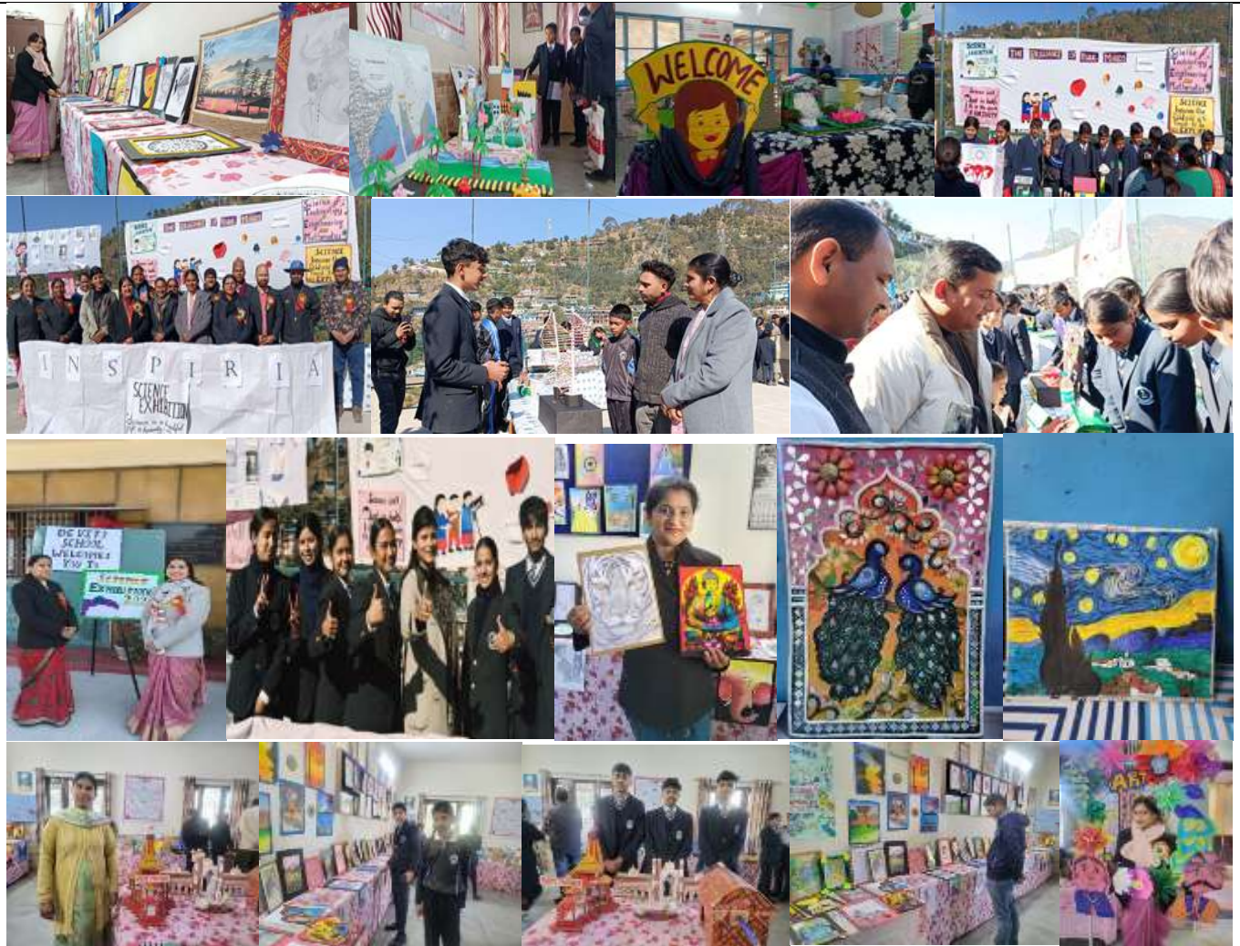
DECEMBER - 2025